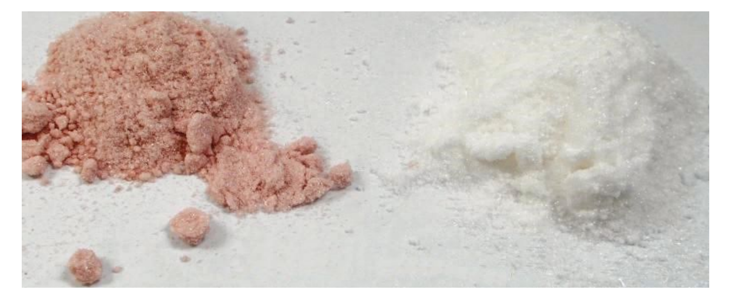
Figure 1 | HX-1 additives can exhibit different levels of purity. The image on the left represents an additive with a noticeable color and offensive odor. Purification produces an additive with higher purity, which is noted by the white.

mance level requirements of the fluid or grease, the maximum treat rate can make it difficult to pass the necessary testing criteria of various applications," he says. "In those circumstances, formulators need to 'load up' on other additives within the same performance class, but care must be taken to use additives that have sufficiently different chemistries not to be viewed as equivalent and causing the total treat rate to exceed the maximum limit allowed. Some additives are synergistic while others have secondary properties offering added benefits allowing the finished H1 lubricant to meet the specifications for its intended use."